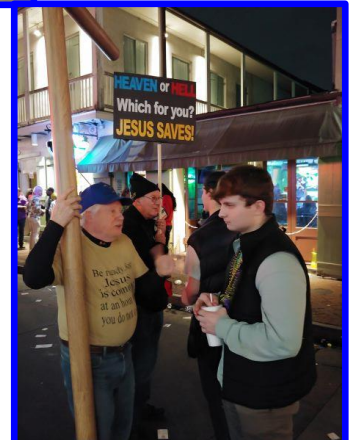
2022 Mission to Mardi Gras