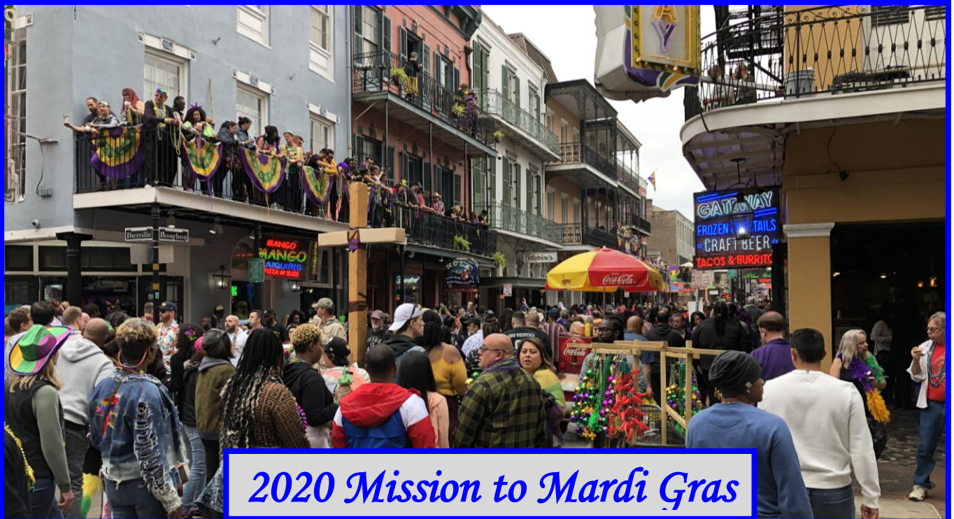
2020 Mission to Mardi Gras