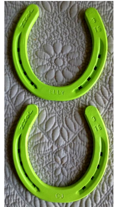
A remembrance for my grandchildren: