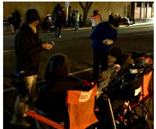
Sharing the Gospel with the crowd.