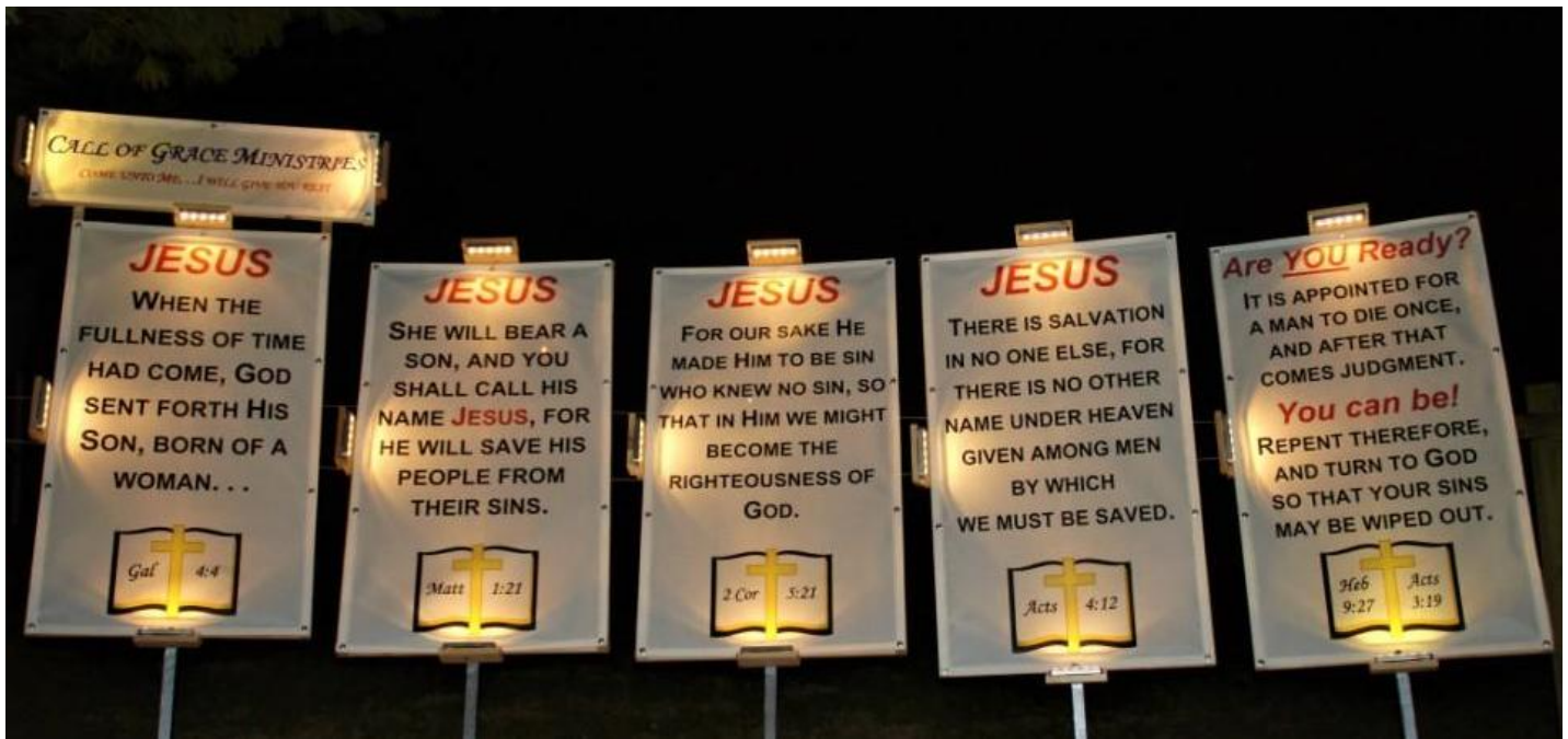
The LORD's message to the crowd in order from Left to Right.