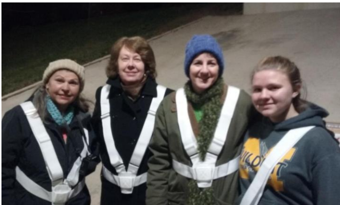
The Parade Team minus 1 (I took the picture). Ready to go!