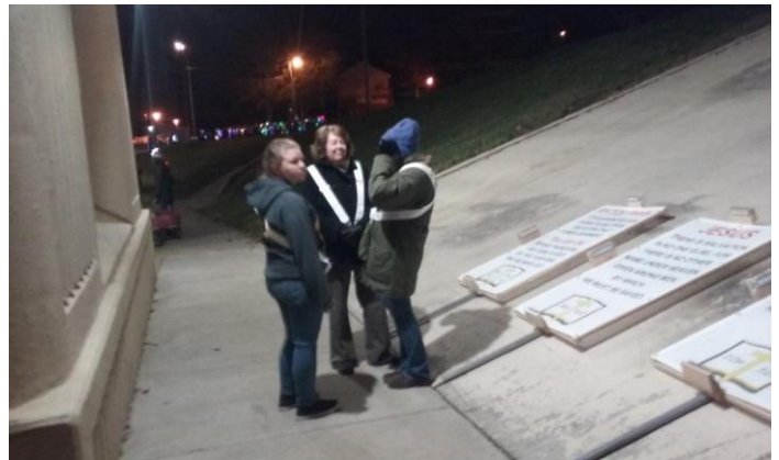
The LORD blessed us with the best assigned staging area to assemble the banners: under an overpass!