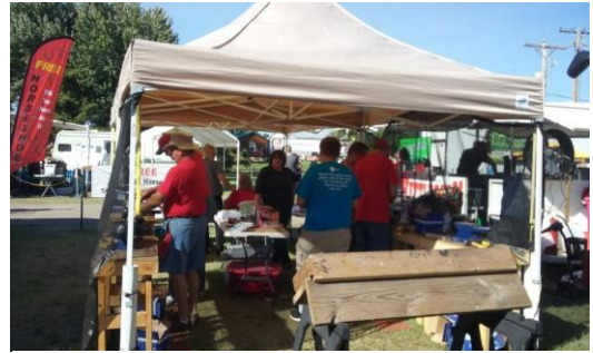
Everybody doing their part in the front tent.