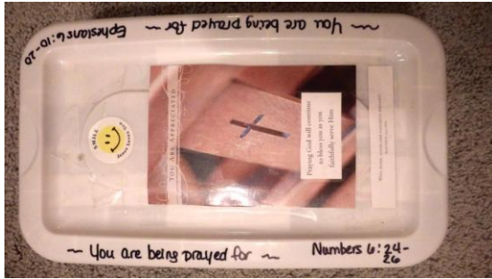
A reminder from some of the ladies at FBC-Marion. Thank you for your prayers .