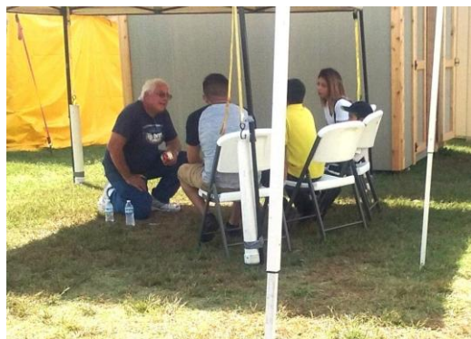
More than once we were so busy that we ran out of chairs. Praise the Lord!