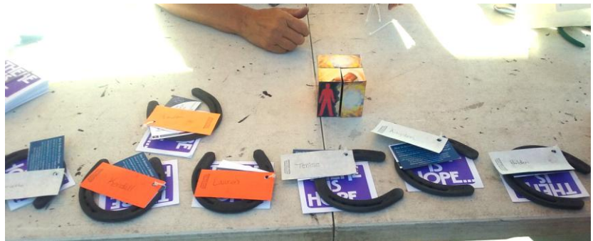
Horseshoes ready to be picked up along with an EvangeCube, which was used many times as an aid to share the Gospel.