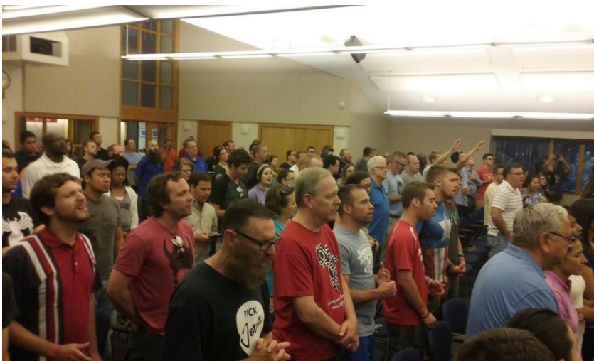
The seminary students at morning worship.