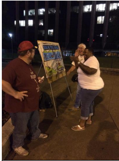
My first time using a sketchboard as a segue to presenting the Gospel.