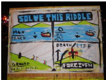
The sketchboard is a method used to engage a person or group in order to share the Gospel.