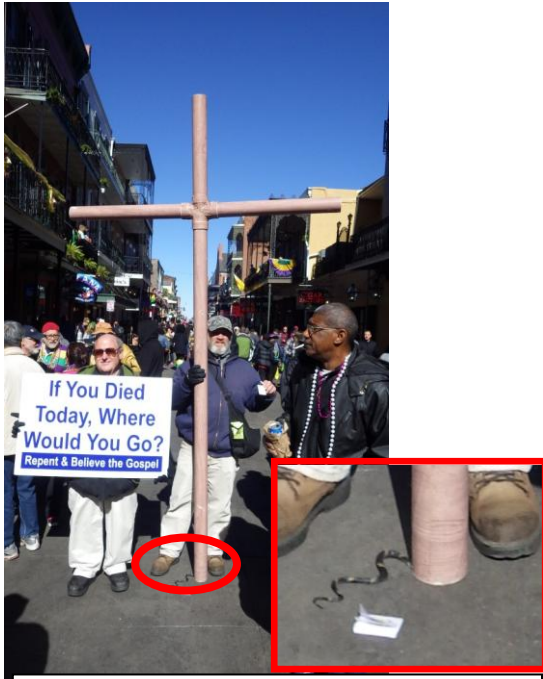
The Message of the Cross - Victory