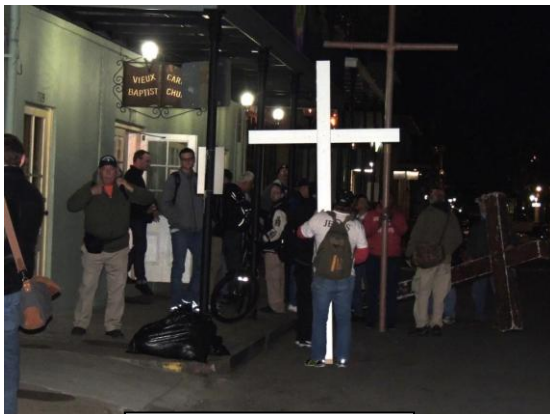
Time to Go