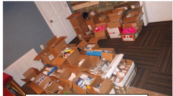
Gospel Seeds for the Sowers