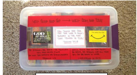
The Blessing Box